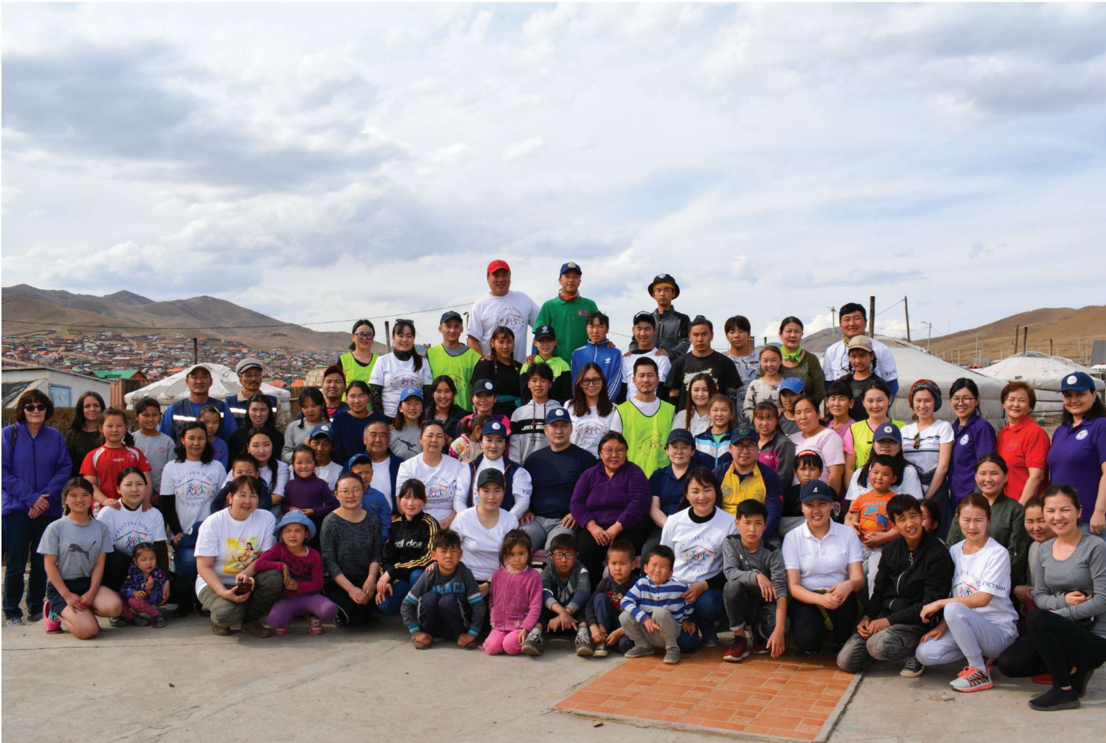
Our CNCF staff & children from CNCF's Ger Village & Noble Club