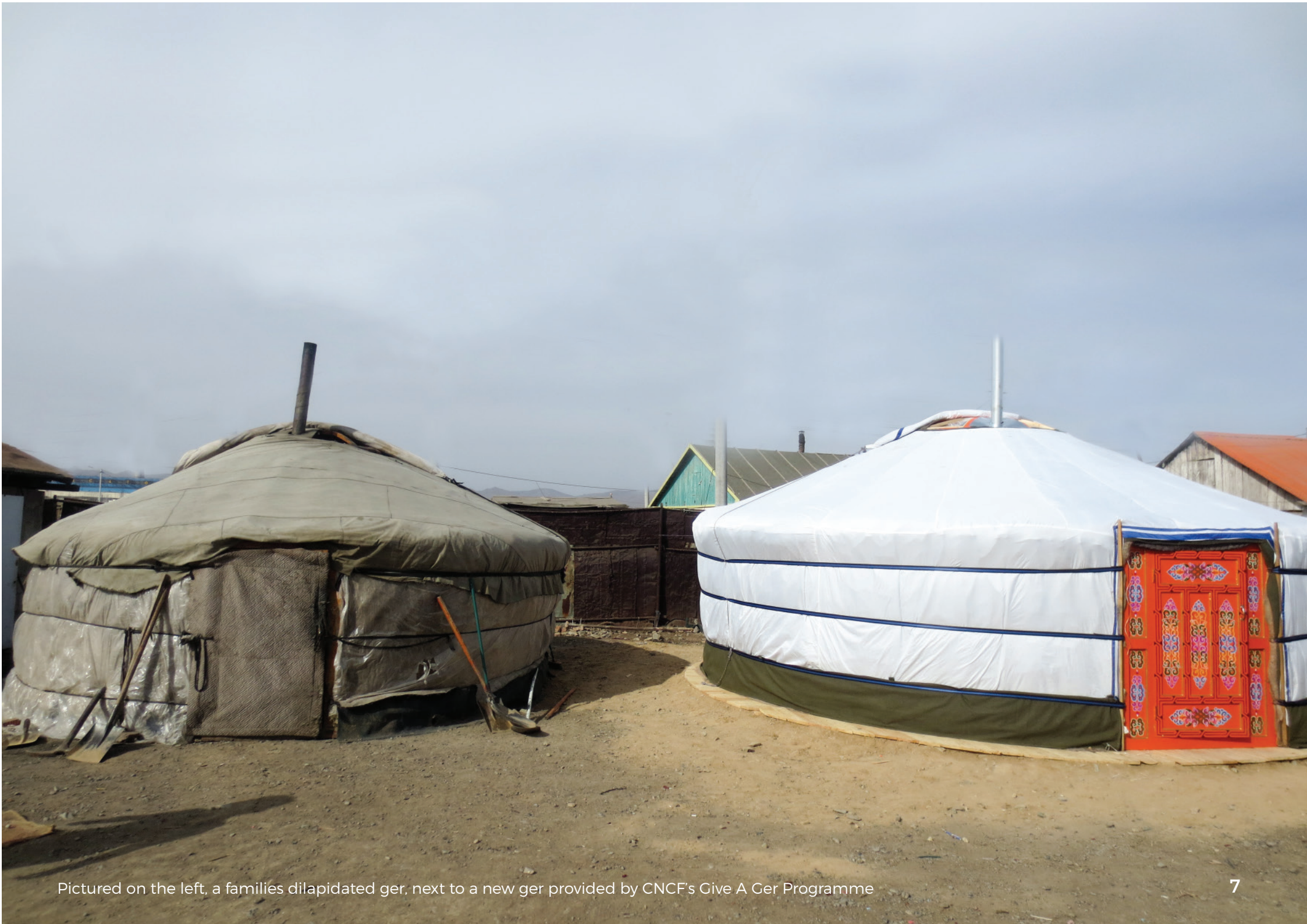
Pictured on the left, a families dilapidated ger, next to a new ger provided by CNCF's Give A Ger Programme